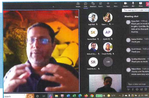
FDP was organised on Research in Digital Age